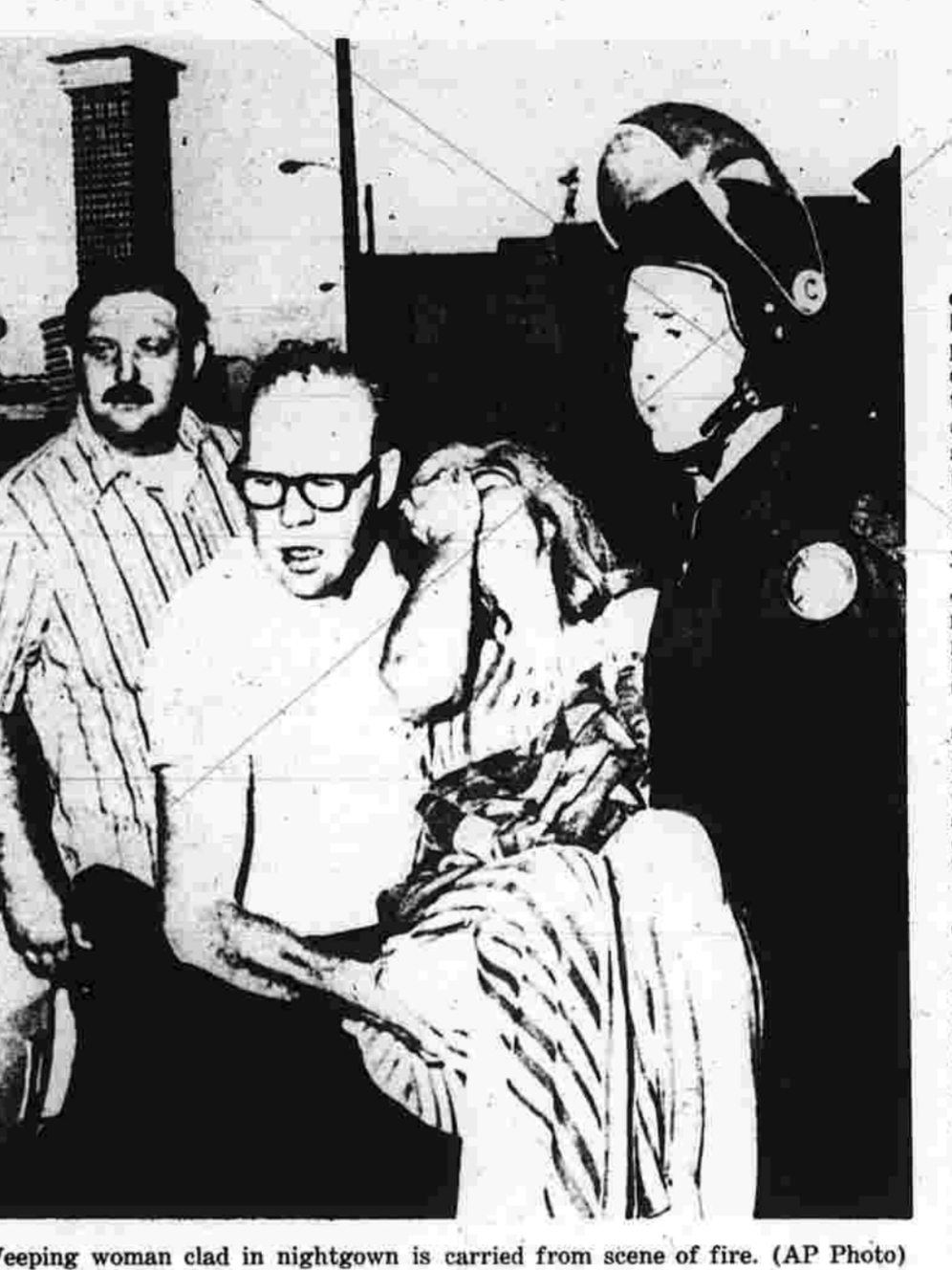
Weeping woman clad in nightgown is carried from scene of fire.