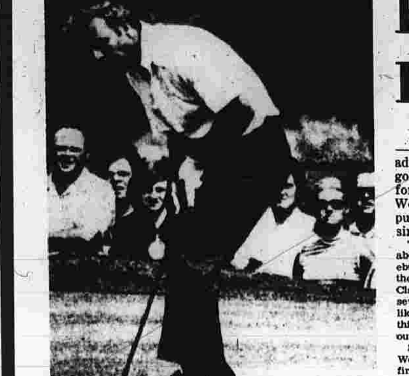
ARNIE'S BACK — Famed Arnold Palmer sinks put after Westchester Golf Classic yesterday to take the first round lead at eight-under-par 64.