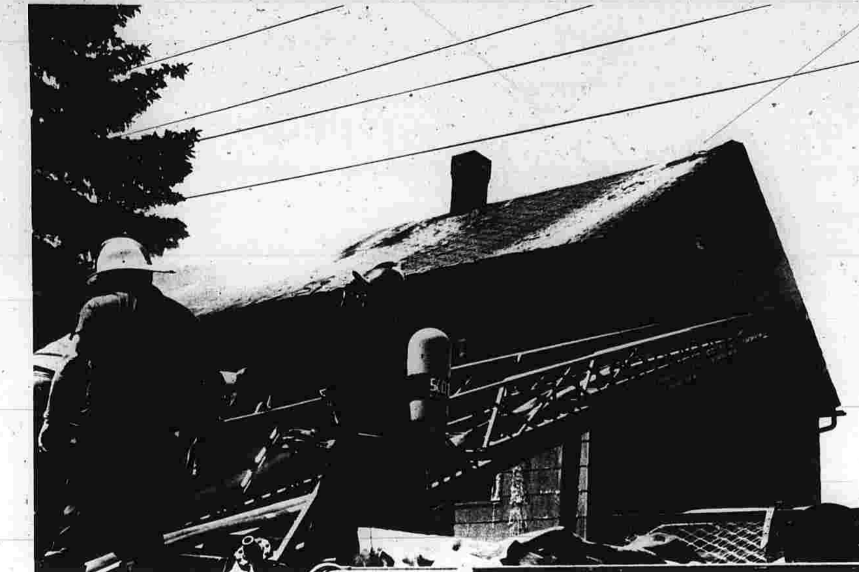
Firemen battle blaze this morning at 56 Thomas St., Rockville.